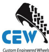
Custom Engineered Wheels

A leader in operational and industrial technology, delivering data driven, process automation solutions to optimize operations for leading North American industrial companies